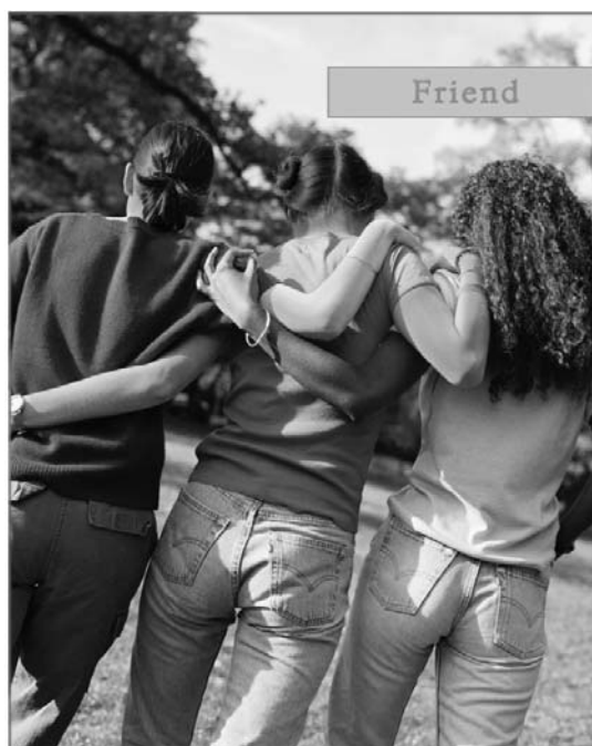
Friend ABUSE VICTIM

ADVERTISERS - Reach the whole state (over a million readers) with just one display ad placement for only $800! See your local participating newspaper or call Cheryl Ghrist at Colorado Press Service, 303-571-5117 ext. 24, for details.